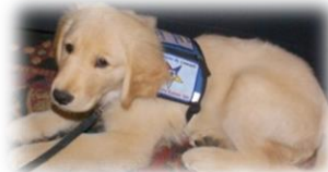
Service Dog donated by Colorado OES

OES chapters serve their communities in a variety of ways. They collect food for needy families, donate funds to train service animals, donate school supplies to disadvantaged students, offer scholarships, support hospitals, participate in walk-a-thons to fund research to cure cancer and other deadly diseases, and sponsor Masonic youth organizations (Job's Daughters International, the International Order of Rainbow for Girls and the Order of DeMolay for boys). Chapters also work together to support several charities. You can view additional information about our charities on our website, www.oes-colorado.org .